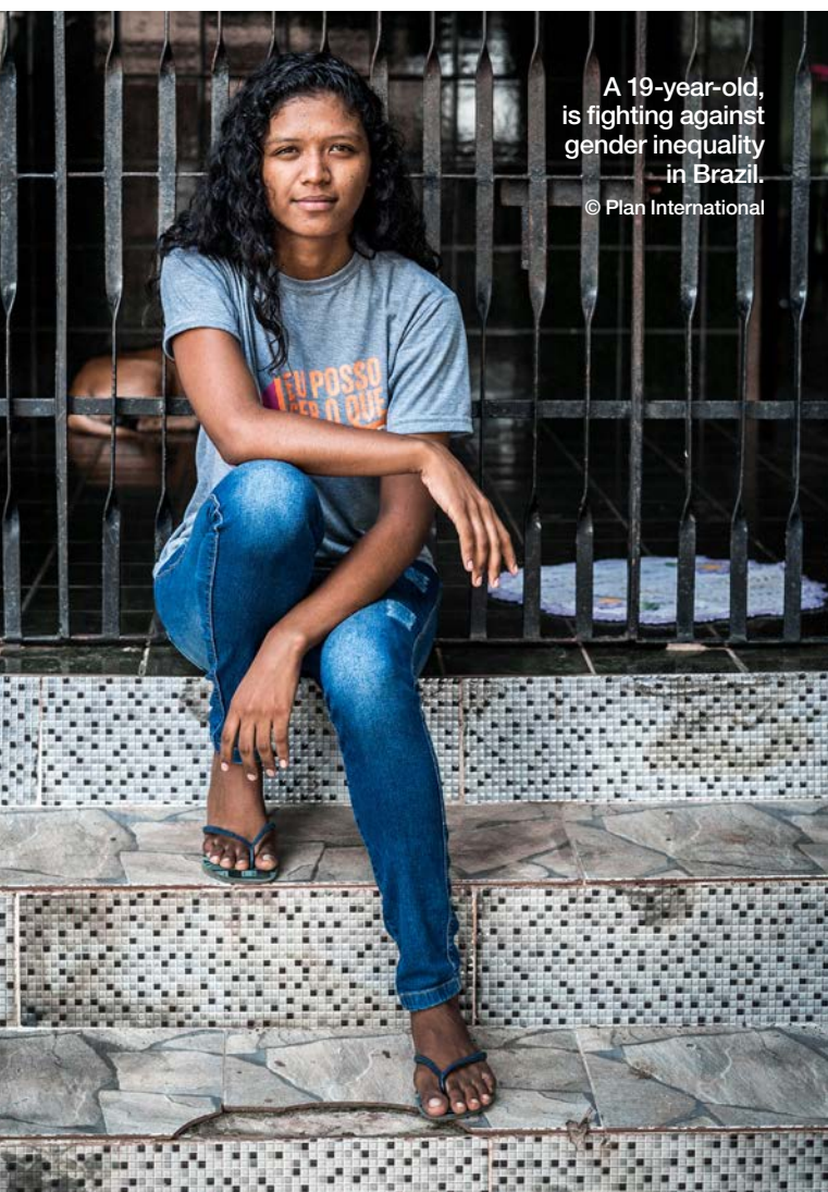
A 19-year-old, is fighting against gender inequality in Brazil.

Additionally, a recent UN Report, using data from 2017-2022, found that bias against women is as entrenched as it was a decade ago. 16