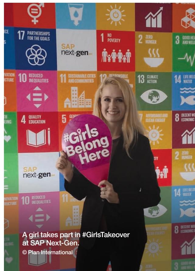
A girl takes part in #GirlsTakeover at SAP Next-Gen.