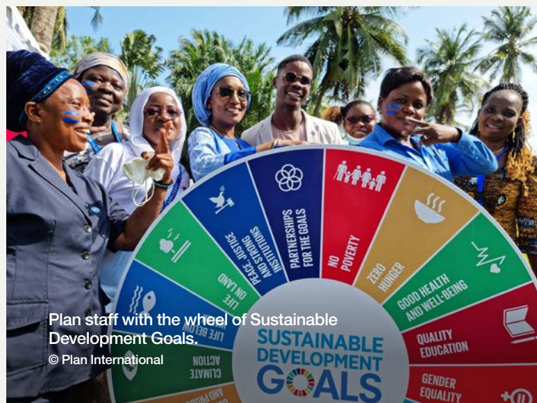
Plan staff with the wheel of Sustainable Development Goals.

Significantly, some activists and many of their audiences, had not even heard of the SDGs which points to a need for better communication and a more targeted understanding between international policy makers and grassroots communities. With this in place, the campaigning energy and commitment of young women activists could be crucial in driving the SDG agenda.