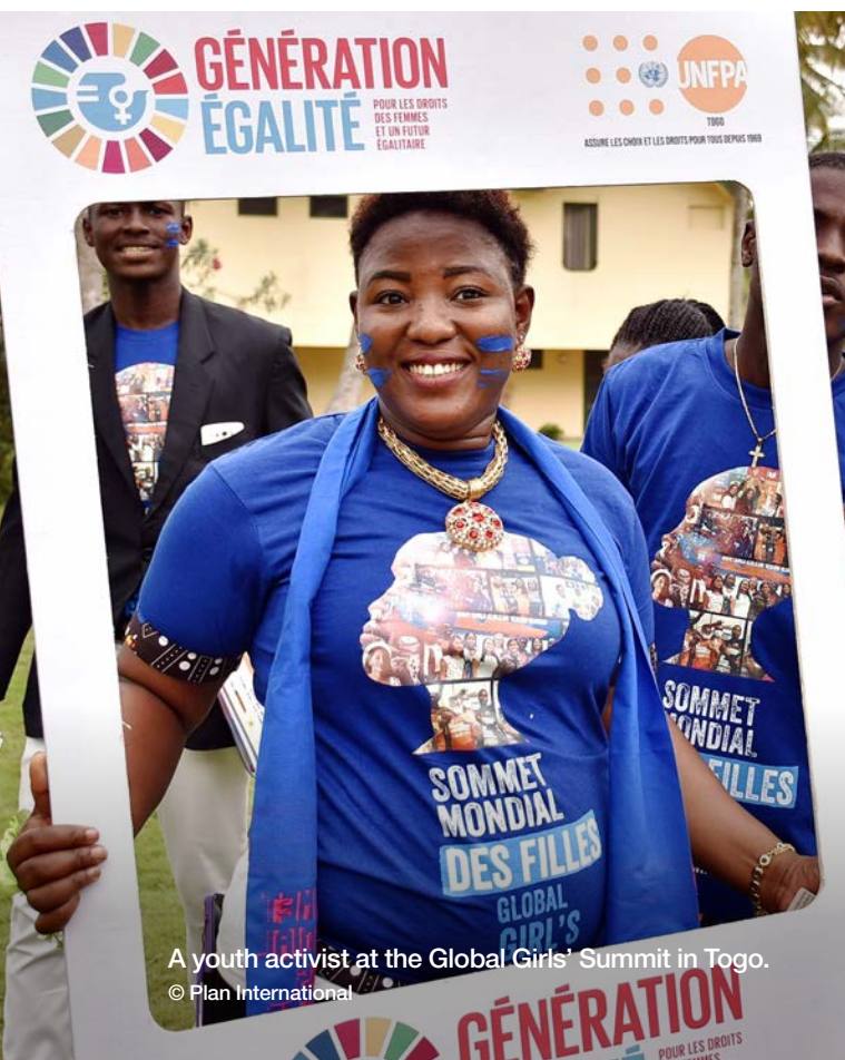
A youth activist at the Global Girls' Summit in Togo.