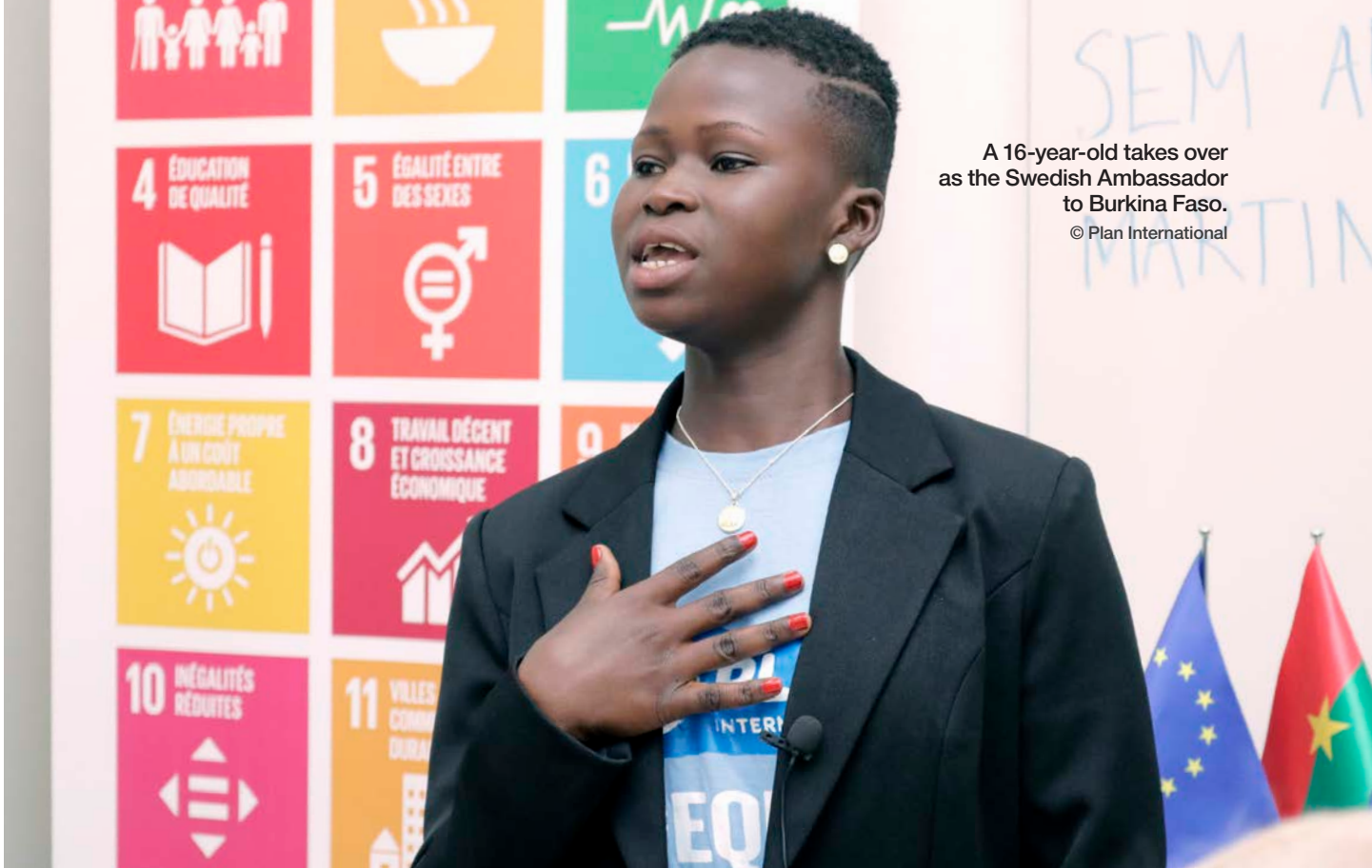
A 16-year-old takes over as the Swedish Ambassador to Burkina Faso.